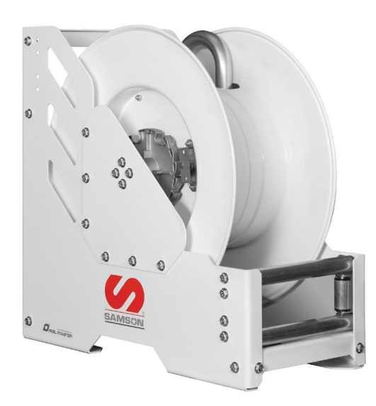
Hose reel in floor/tank position